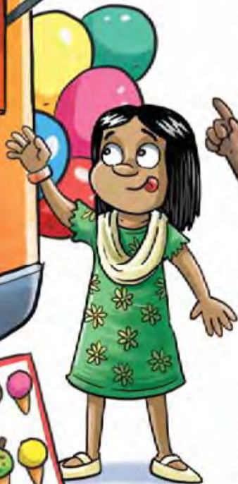
1st first 1 okokuqala