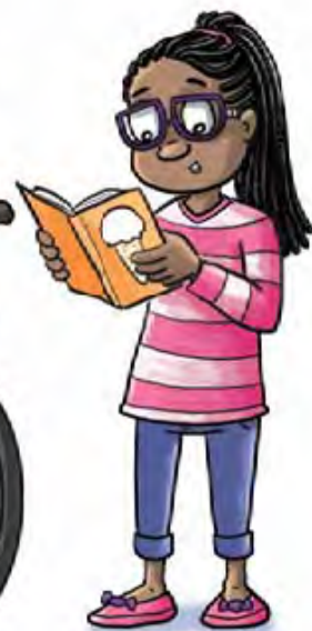
4th fourth 4 isine