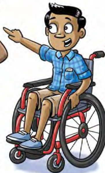
3rd third 3 isithathu