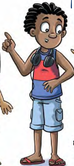
2nd second 2 isibili